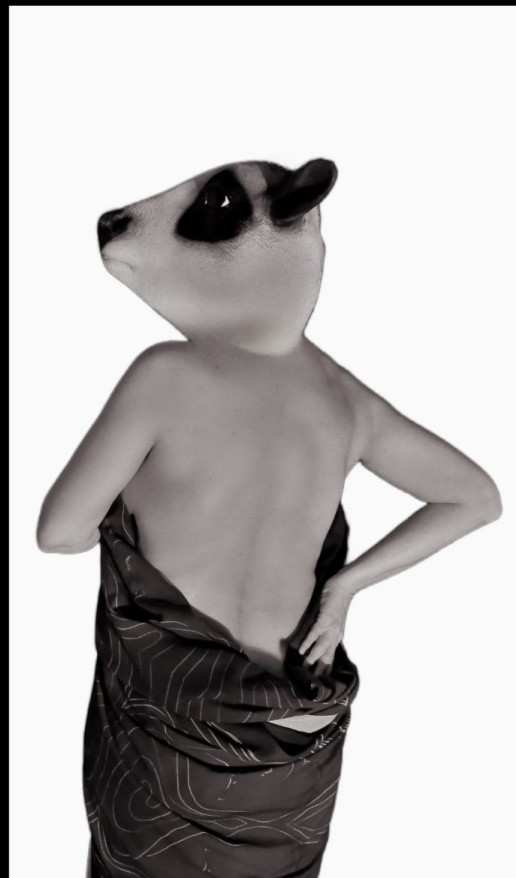
Milk Visions 2024