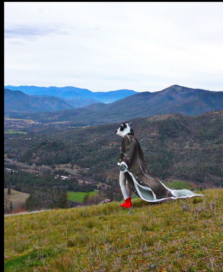
Milk Visions 2024