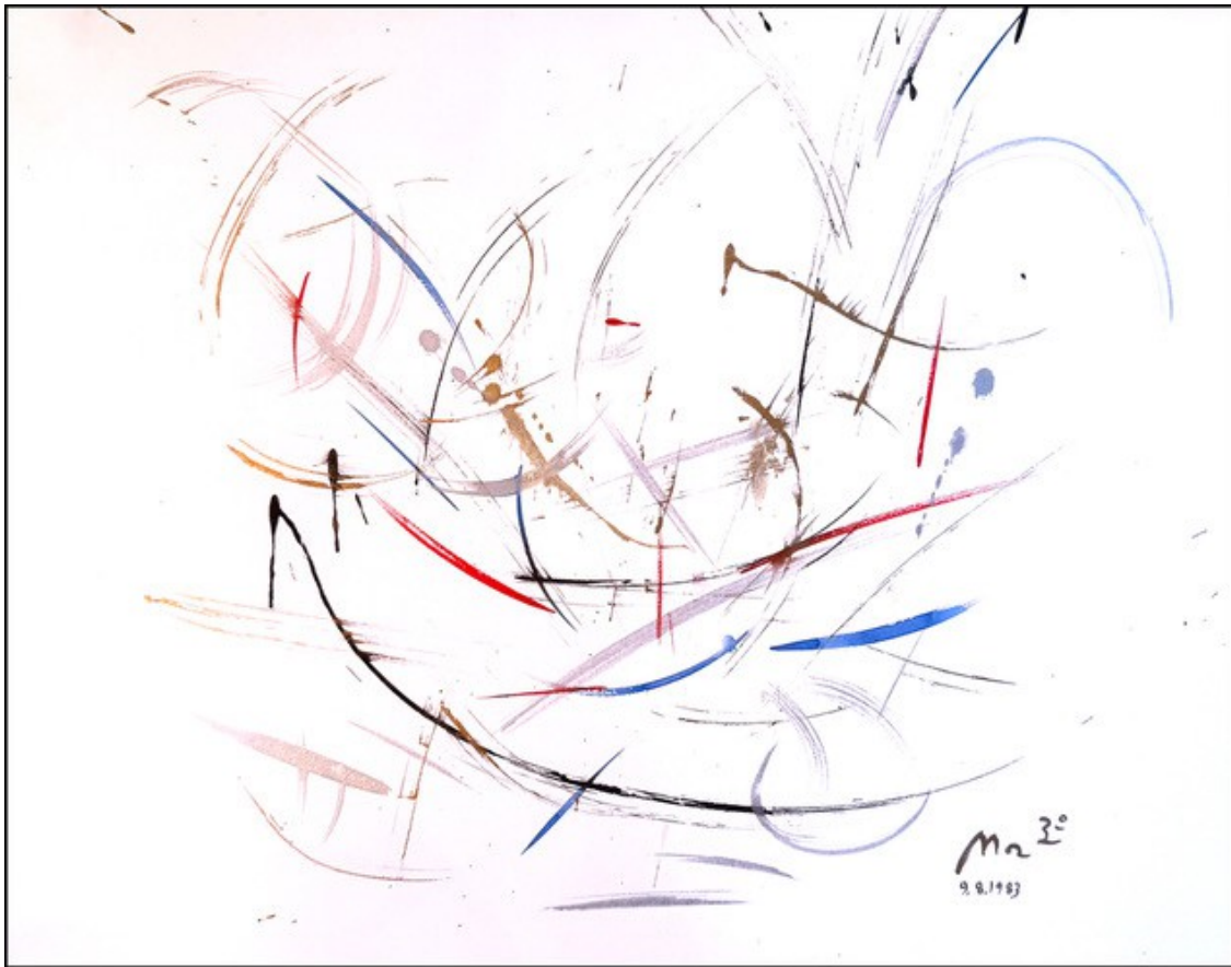
Cosmic Dance #2 watercolor on aquarelle paper 16" x 21"