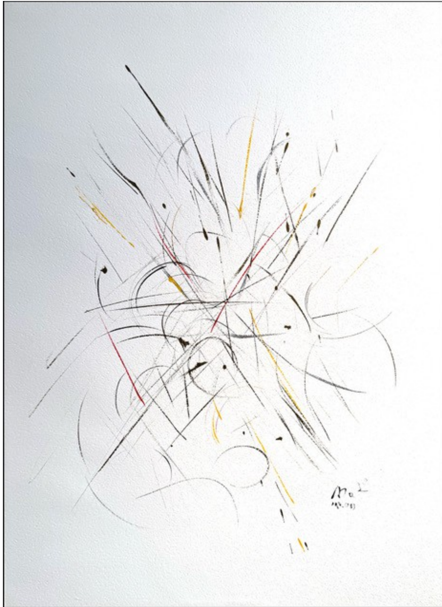
Cosmic Dance #4 watercolor on aquarelle paper 19" x 14"