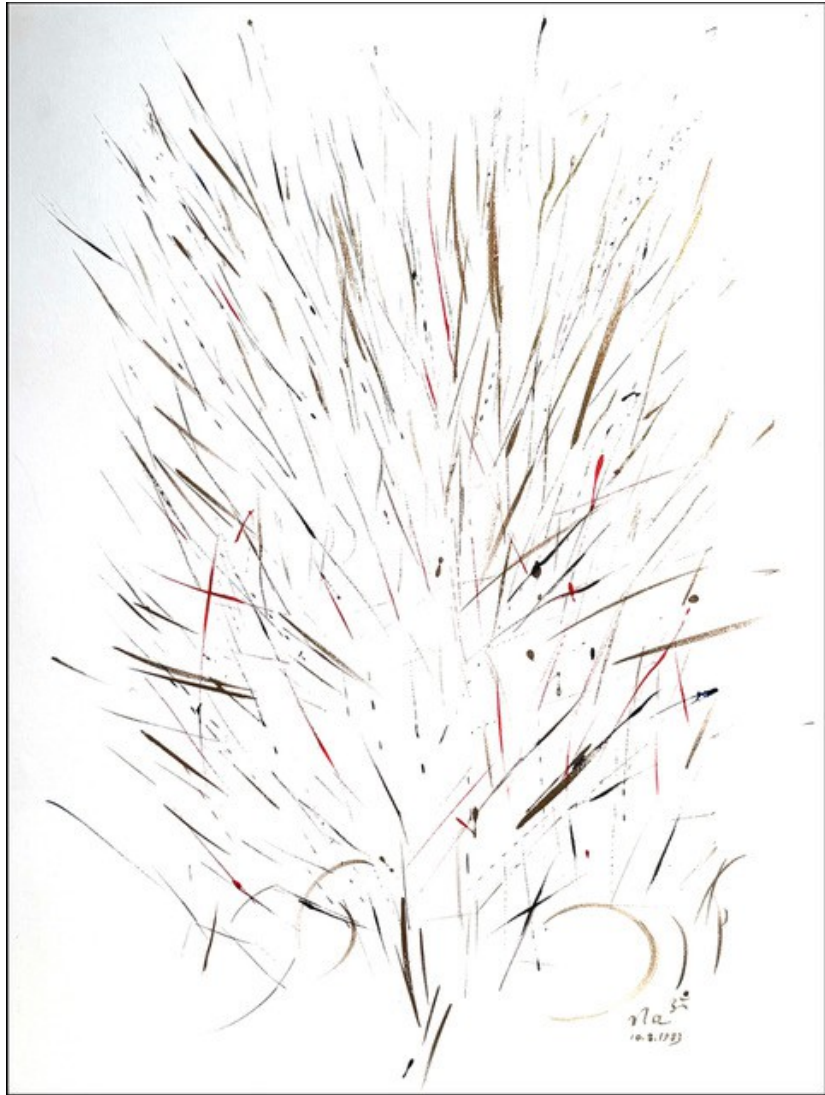
Cosmic Dance #3 watercolor on aquarelle paper 22" x 16"