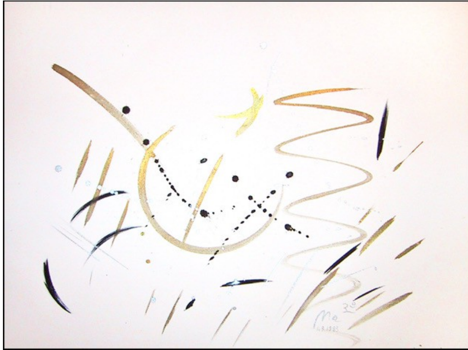
Cosmic Dance #6 watercolor on aquarelle paper 16" x 22"